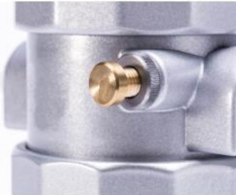
PA-68 auto drainage adjustment valve

Adjustable drainage time setting based on displacement.